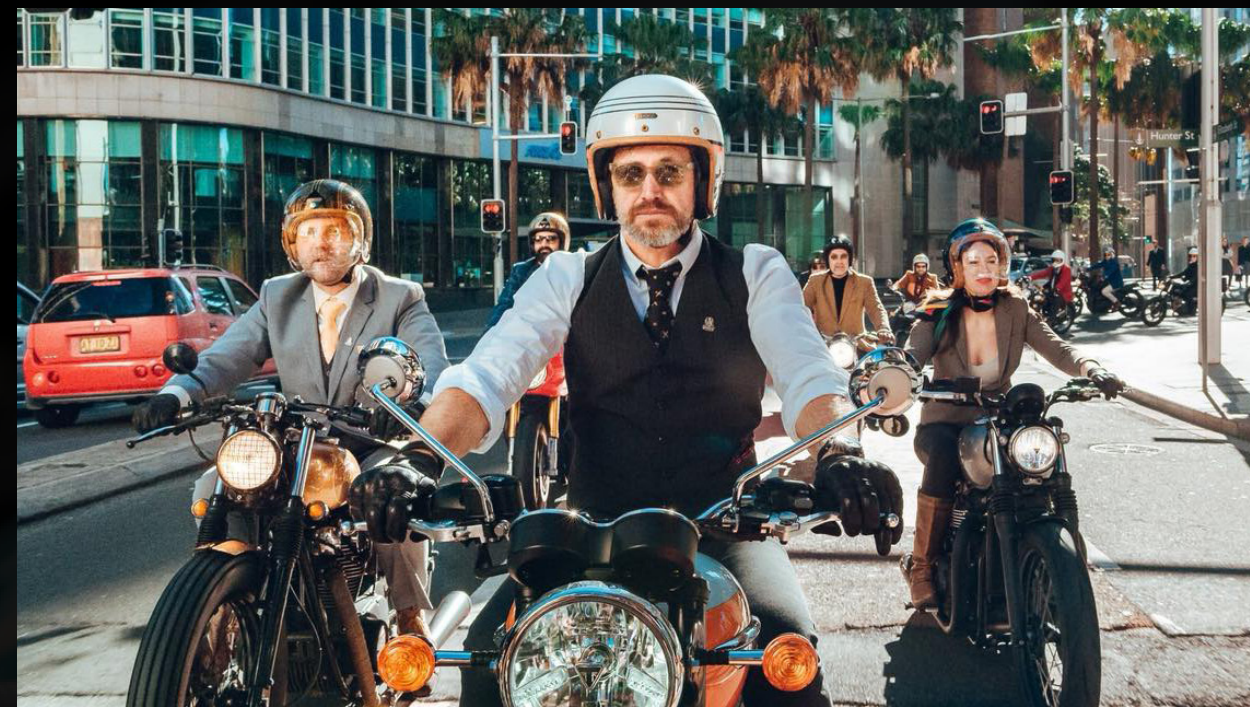
2018 LAUNCH VIDEO