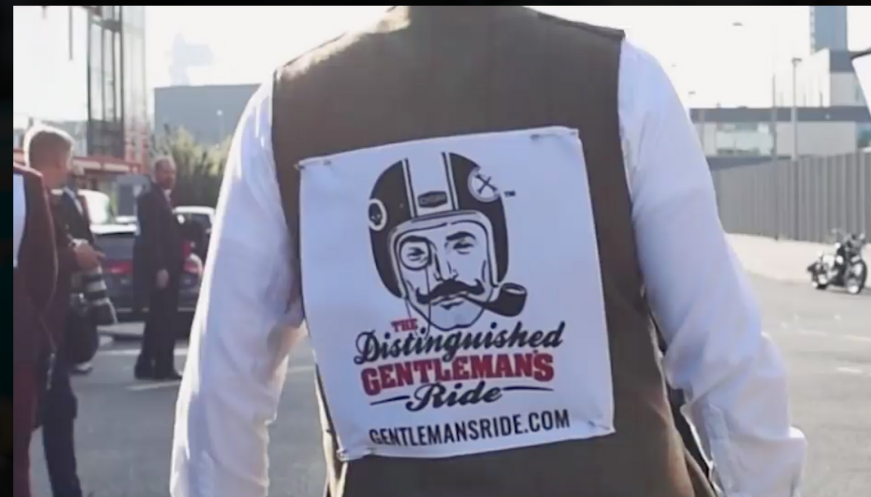
2017 WRAP UP VIDEO